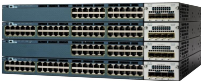
Figure 2. Cisco Catalyst 3560-X Series Switches

Figure 2 shows Cisco Catalyst 3560-X Series Switches.