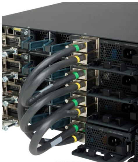
Figure 3. StackPower Connector

The Cisco Catalyst 3750-X Series introduces Cisco StackPower technology, innovative power interconnect system that allows the power supplies in a stack to be shared as a common resource among all the switches. Cisco StackPower unifies the individual power supplies installed in the switches and creates a pool of power, directing that power where it is needed. This feature is available in all Cisco Catalyst 3750-X Series Switches feature sets*. Up to four switches can be configured in a StackPower stack with the special connector at the back of the switch using the StackPower cable**, which is different than the StackWise cables. (See Figure 3.)