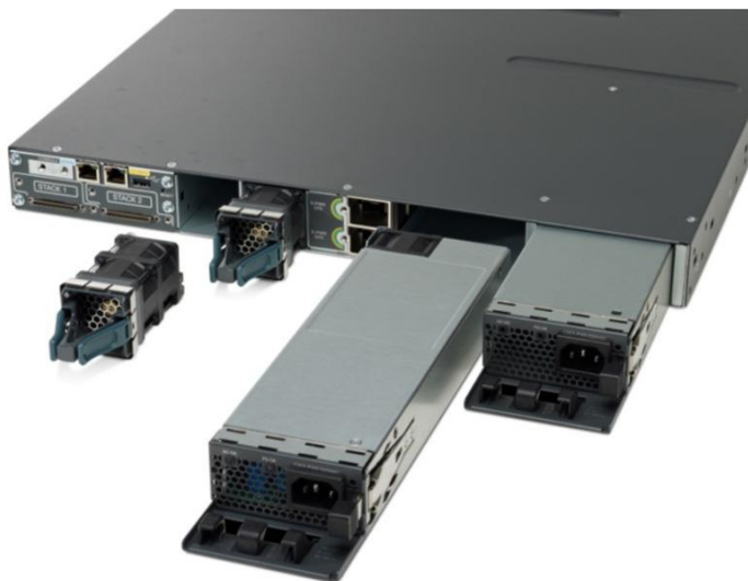
Figure 5. Dual Redundant Power Supplies

The Cisco Catalyst 3750-X Series and 3560-X Series Switches support dual redundant power supplies. The switch ships with one power supply by default, and the second power supply can be purchased at the time of ordering the switch or at a later time. If only one power supply is installed, it should always be in the power supply bay 1. (See Figure 5).